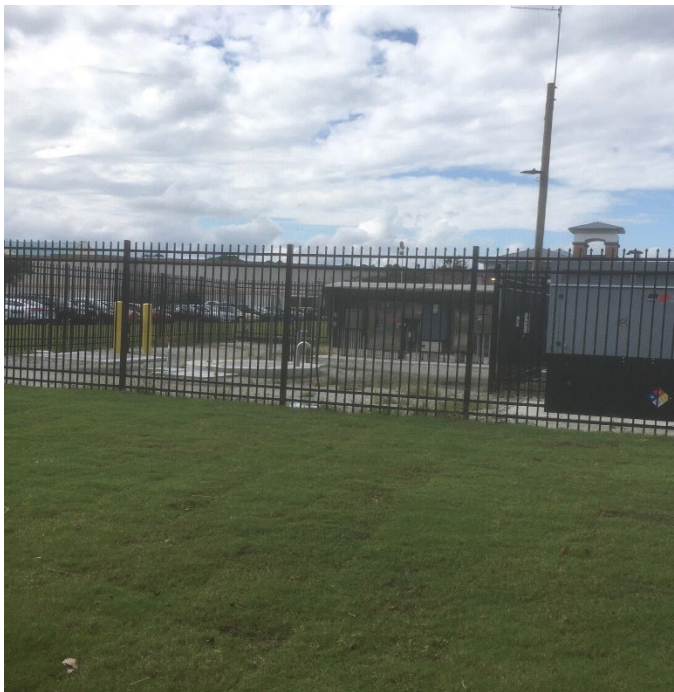
Figure 2: PUMP STATION 5 Independence Mall